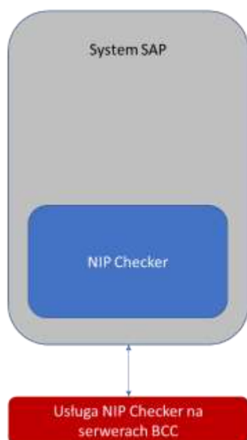
Wariant A. Połączenie bezpośrednie (D)